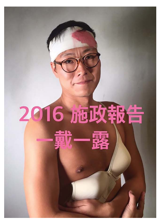
Figure 5 Image circulated by a Hong Kong journalist that takes a satirical view of One Belt, One Road. The words accompanying the image translate to: "2016 [China's] governance report: To wear and to reveal." Source: Dong Fang Sheng. Reproduced with permission. (Color figure available online.)

Meanwhile, the idea of OBOR has itself spun off into different popular renditions in a variety of contexts. Within Mainland China, a statue officially translated into English as "Song of Belt and Road" (一带一路之歌) was unveiled at the Boao Forum for Asia held in Hainan Province in 2015 to mark the OBOR initiative's contributions to that island's future. Donated by a corporation based in Chongqing (Sichuan Province), the statue, which is made up of a golden arc encircled by a wavy line (denoting respectively the road and belt components in the OBOR project), likens OBOR to a harmonious melody that will unite the world and bring win-win benefits for the global community. The municipality of Chongqing has also taken the opportunity to raise its profile, presenting the artefact as a symbol of the Chongqing's ability to serve as the "golden key" to unlock OBOR's enormous potential. Alternatively, however, netizens in Hong Kong have hinged on a local journalist's satirical conversion of the term "一带一路" (One Belt, One Road) to the phonetically similar expression "一戴一露" (to wear and to reveal), mocking the overt "wearing" of the OBOR