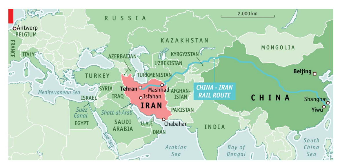
Figure 2 The China–Iran railroad on which direct trains commenced running in April 2016. (Color figure available online.)

relationships between China and the world beyond) to establish a platform for regional and global economic cooperation. In this sense, there is not always a singular belt or road that can be identified; rather, OBOR serves as a cultural metaphor to characterize two projects with expansive geographical possibilities—one over land and the other forging linkages in the maritime sphere—for the revitalization of global economic exchanges and interactions. Given such a formulation of OBOR as an open and extensive venture that simultaneously appears on maps as a set of lines, there is a need to attend to how this initiative is taken up through a range of Chinese narratives.