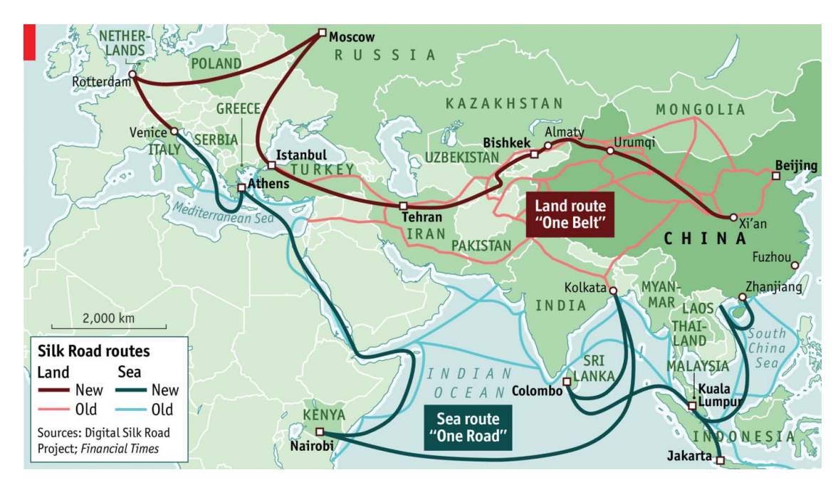
Figure 1 The geographical coverage of the One Belt, One Road Initiative. (Color figure available online.)

Southeast Asia or across the Karakoram to the Arabian Sea via Pakistan. The depiction of the land belt, running near the Iraqi city of Mosul and then through those parts of northeastern Syria governed by Kurdish insurgents, seems fanciful. Parts of the "route," however, are in place or under construction and the idea of OBOR seems to have already gained traction on the ground. Indeed, earlier in 2016, The Economist ("Foreign Policy" 2016) reported on the opening of a direct train service between the Iranian capital of Tehran and the transport and commercial hub of Yiwu City in eastern China: